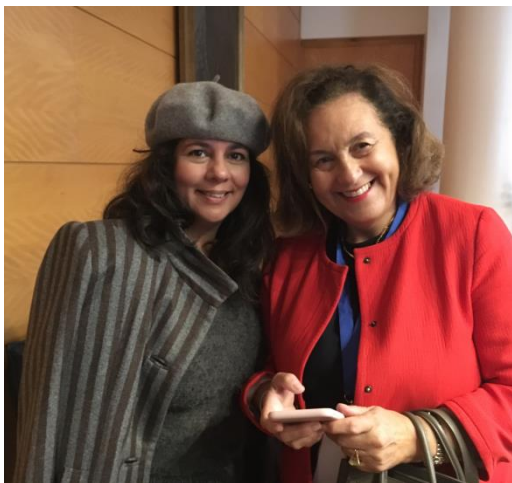
Women working for women – across Europe and across generations